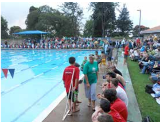
Family and friends voice their enthusiastic support at the annual Highway district gala.

The annual highway district gala is always a fun yet competitive evening of inter group swimming events. These range from the cub relays to keep a cardboard toilet role dry, the inflated tube race, the scout medleys and individual events and the highlight of the evening...the adult leaders race of course!